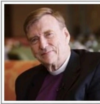
Bishop John Shelby Spong Recovering the Jewishness of the Christian Gospel Hearing Authentic Christianity with 21st. Century Ears