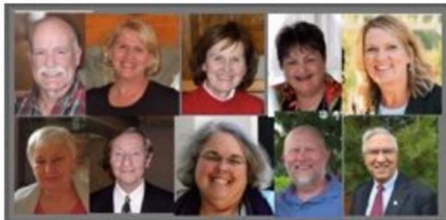
Assembly Planning Team